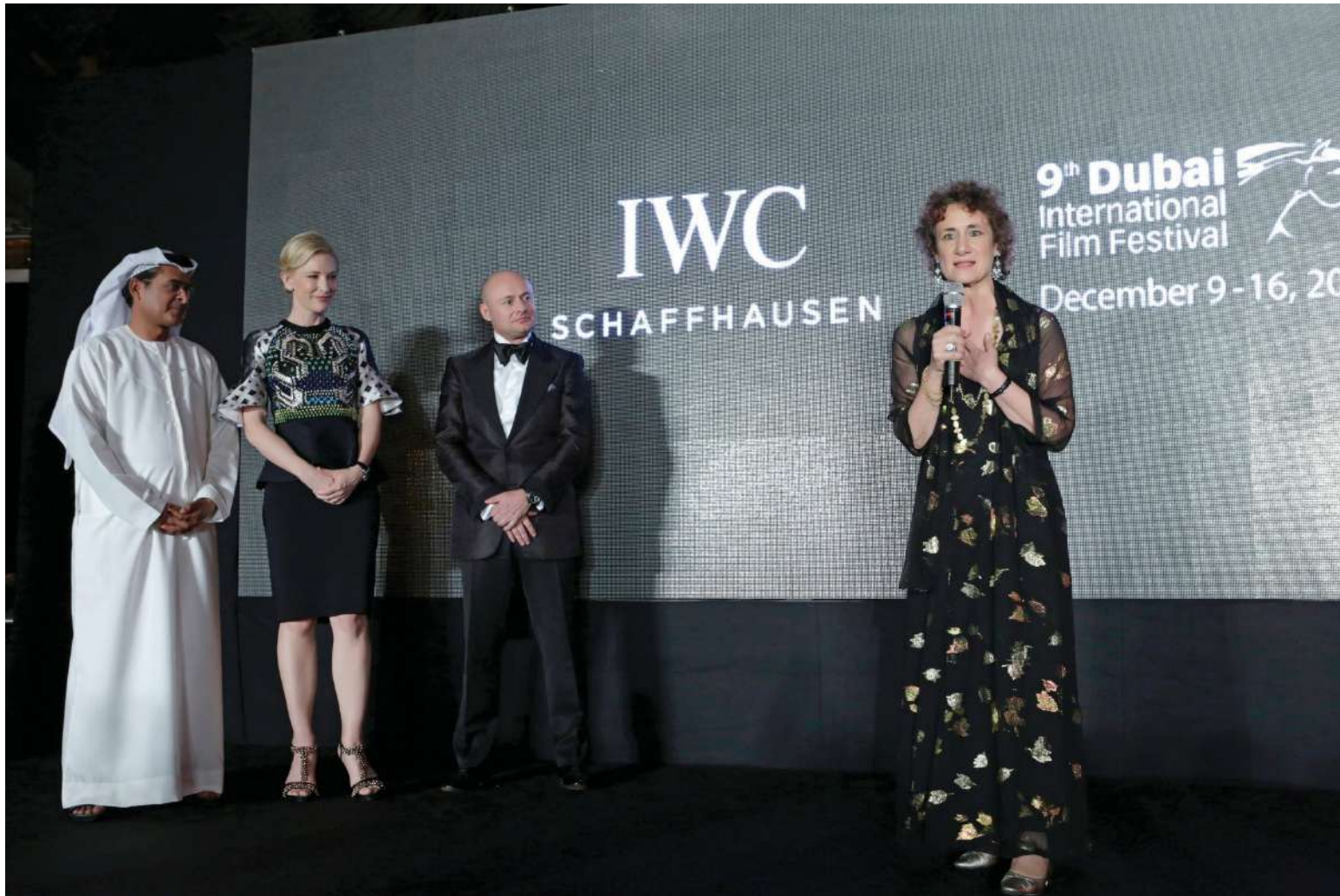
Gala event in Dubai for the IWC Filmmaker Award 2012