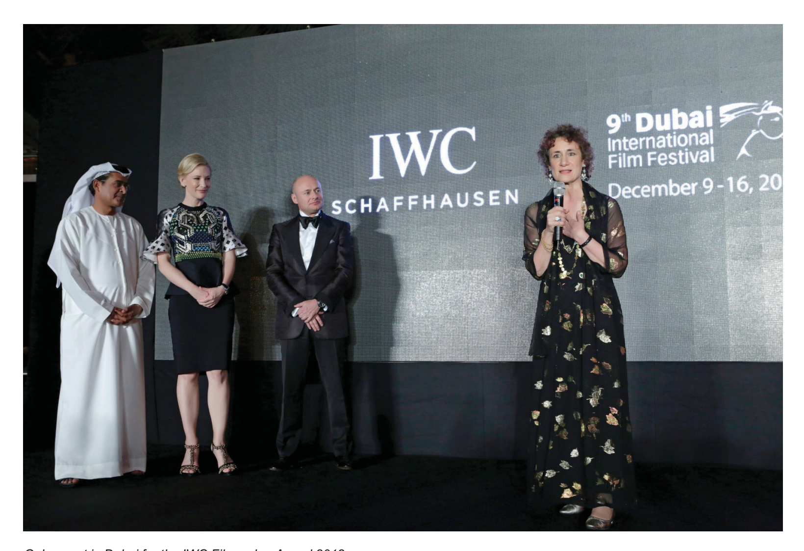
Gala event in Dubai for the IWC Filmmaker Award 2012